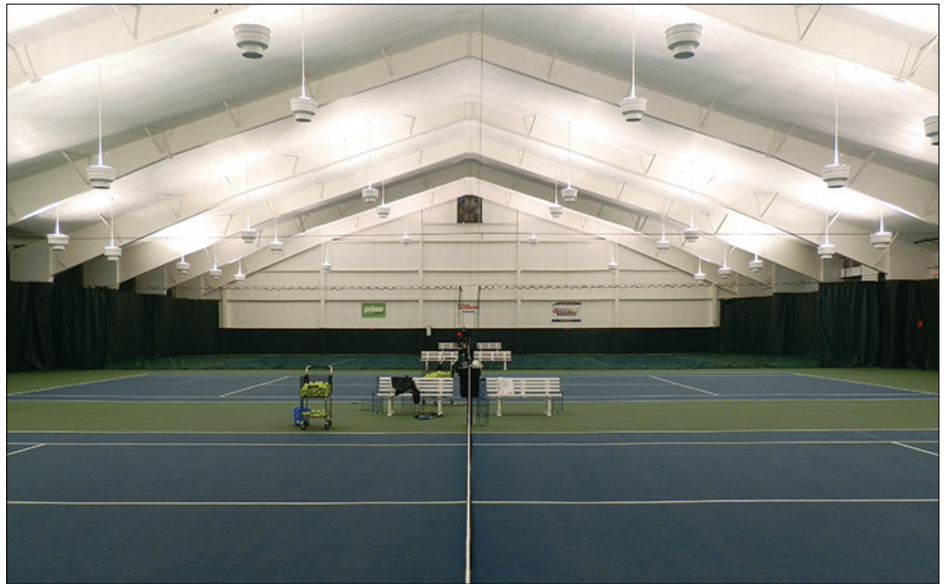
DEER CREEK TENNIS CLUB, IL - 37% Energy Savings, T9 630 Watt - 25% MORE Light than 1000 watt fixtures!