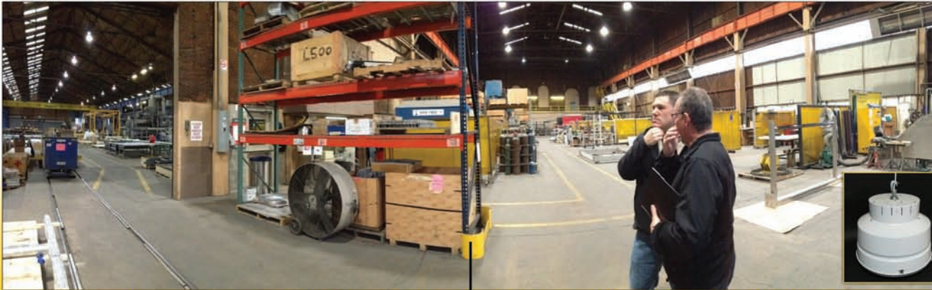
Duquesne Electric 1000 Watt Existing – Before. ← → Duquesne Electric – After T9-630 Watt MH-XL-Direct.