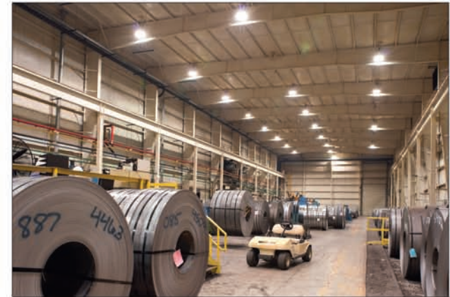
T9 With Super Reflector Technology Direct and Indirect Fixtures

Replaces all 1000 and 400 Watt HID’s with MORE Light