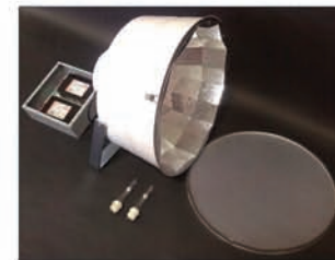
T9-630 Watt MH-XL-Wall Mount