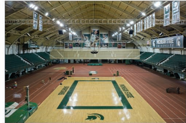
T9 With Super Reflector Technology Direct and Indirect Fixtures

Replaces all 1000 and 400 Watt HID's with MORE Light